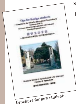
Brochure for new students

PS: Only a few of the OICE activities are briefly mentioned here. Anyone interested in knowing more may please visit the OICE personally for further details.