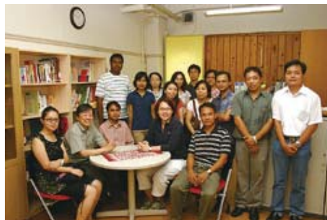
A view of the OICE during an informal gathering

The Office for International Cooperation and Exchange, popularly known as OICE, was established in its present form in 2003. OICE members consist of one regular staff, and three advisory members (Head and two advisors). In addition, one temporary personnel, from the International Student Section, provides technical support.